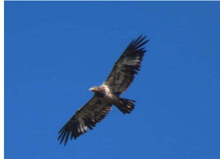
Juvenile Bald Eagle