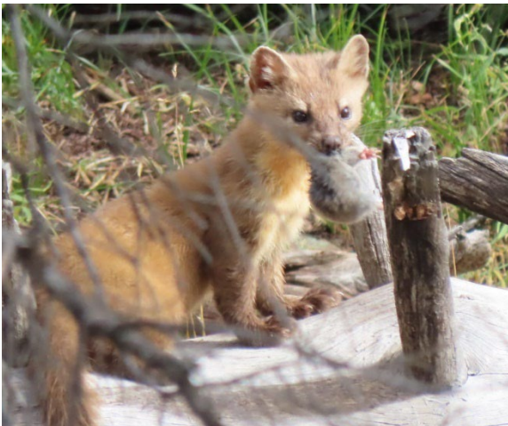
Pine Marten with a Vole

As we were passing the pond KC spotted a Pine Marten! We followed it and got quite the show as it was hunting a vole, he caught it and then did what all mommas say not to do, "don't play with your food" it was quite the sight! The best thing all morning. We also saw a few chipmunks and cute squirrels.