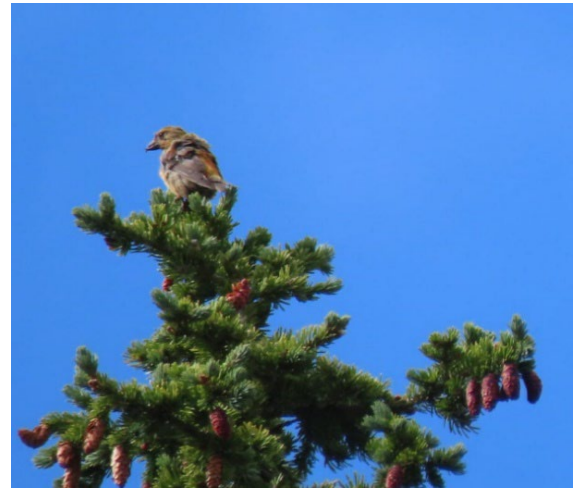
Female Red Crossbill

As we entered the campground a couple of Pine Grosbeaks flew over. We also had a "sitting still" Red Crossbill. A group of White-crowned Sparrows were taking a bath in the meadow. In the trees around there, a couple of Pine Siskins , and a pair of Wilson's Warblers were flitting around. At the car we had a Sharp-shinned Hawk flyover.